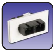
MX-SMB-SC-XX ..... Bezel with duplex multimode/singlemode SC adapter