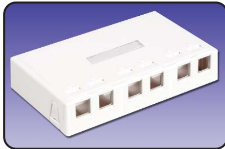
MX-SM6-XX .....6-port box with cover, base, three (2-port) MAX bezels, cable ties, screws, and designation labels

Use (XX) to specify color: 01 = black, 02 = white, 20 = ivory, 80 = light ivory.