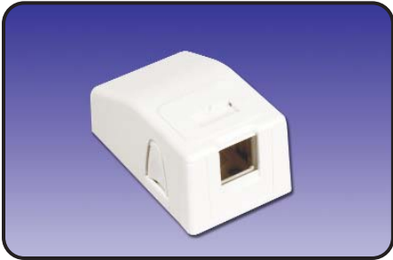
MX-SM1-XX .....1-port box with cover, base, one single port MAX bezel, cable ties, and screws

Field-assembled surface mount boxes with MAX® bezels. Accepts flat MAX modules (ordered separately).