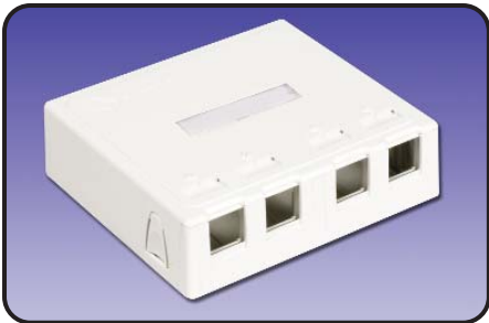
MX-SM4-XX .....4-port box with cover, base, two (2-port) MAX bezels, cable ties, screws, and designation labels