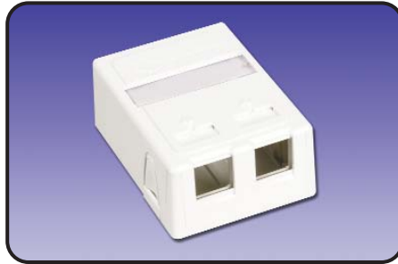
MX-SM2-XX .....2-port box with cover, base, one (2-port) MAX bezel, cable ties, screws, and designation labels