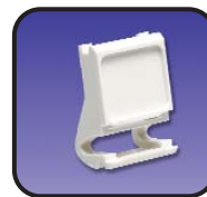
MX-SM-BLNK-XX ..... A single blank insert for an unused port. May be used with MAX or multimedia bezels

Use (XX) to specify color: 01 = black, 02 = white, 20 = ivory, 80 = light ivory.