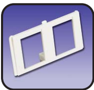
MX-SMB-MM-XX ..... Multimedia 2-port bezel

For LC, SC duplex fiber adapters and TERA® options, see MX-SM multimedia bezels below.